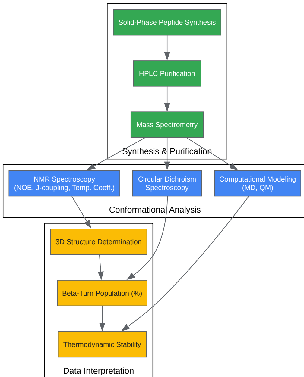
Figure 2: Experimental Workflow for Beta-Turn Analysis

Click to download full resolution via product page