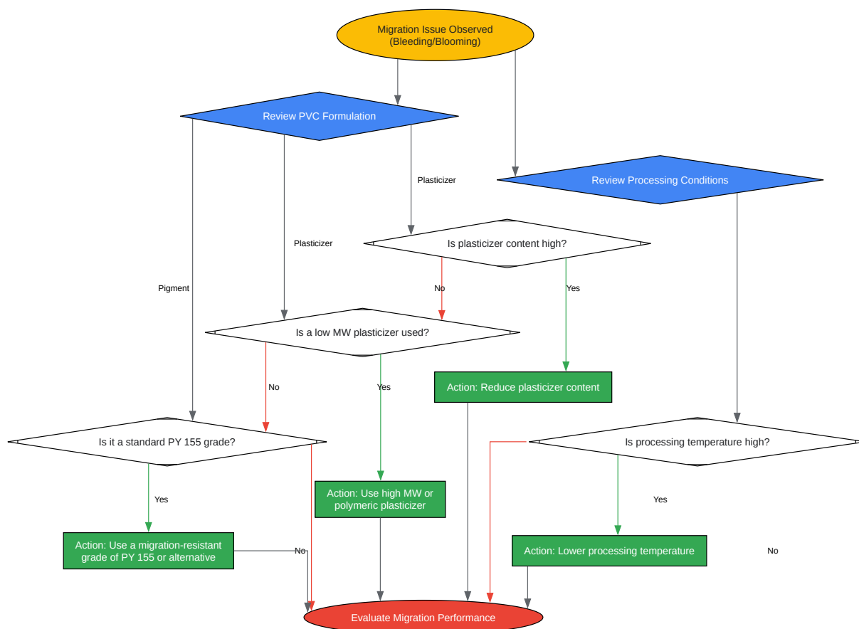
Caption: Mechanism of Pigment Migration in Plasticized PVC.

Click to download full resolution via product page