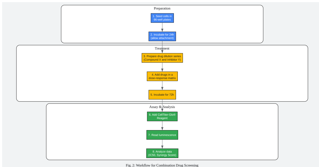
Fig. 2: Workflow for Combination Drug Screening

Click to download full resolution via product page