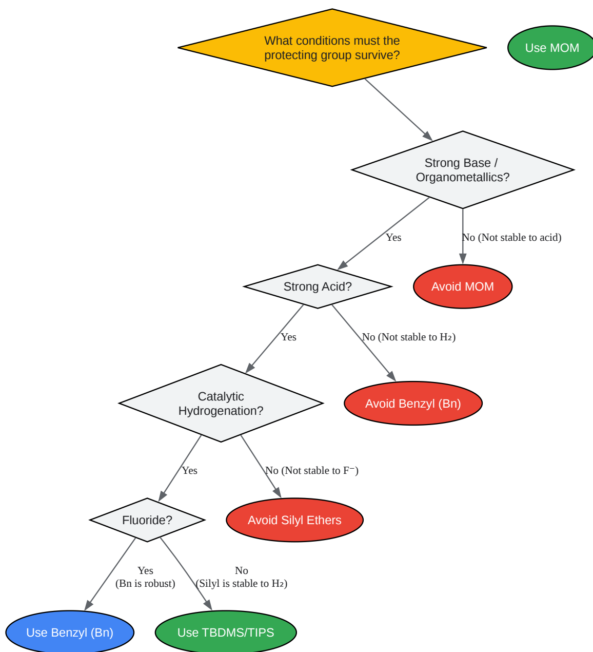
Decision Guide for Protecting Group Selection

Click to download full resolution via product page