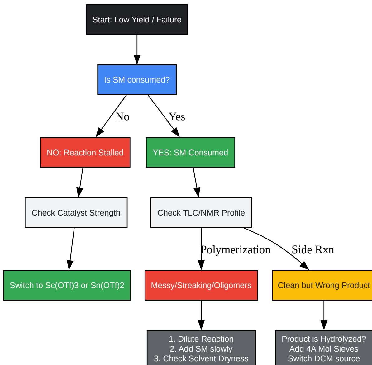
Diagram 2: Troubleshooting Logic Flow

Click to download full resolution via product page