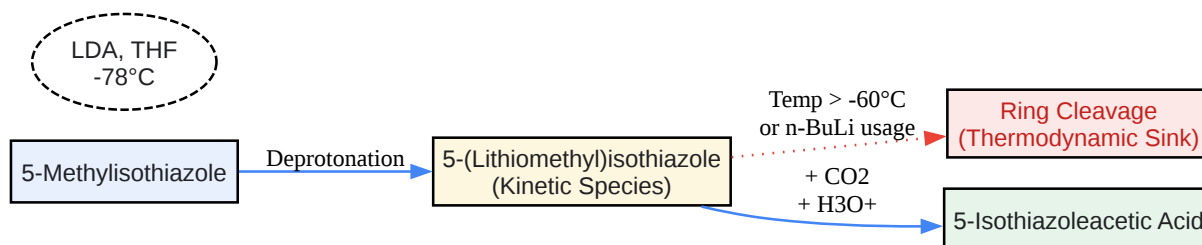
Figure 2: Selectivity in Lateral Lithiation of Isothiazoles

Click to download full resolution via product page