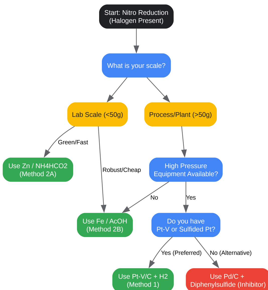
Diagram 1: Method Selection Decision Tree