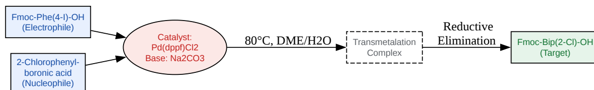
Fig 1: Suzuki-Miyaura Cross-Coupling Pathway for Fmoc-Bip(2-Cl)-OH

Click to download full resolution via product page