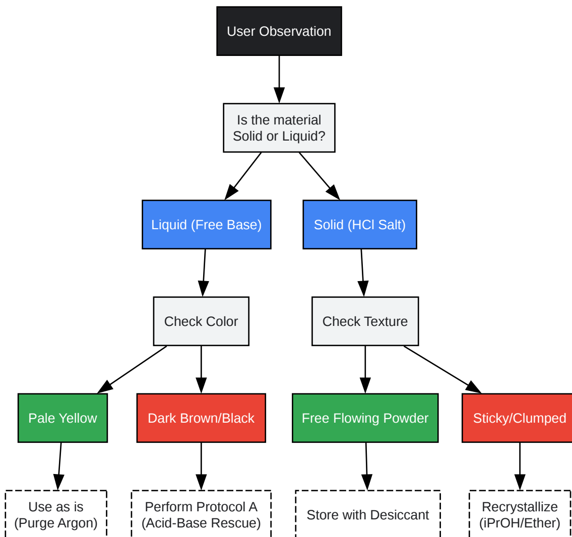
Diagram 2: Troubleshooting Decision Tree

Click to download full resolution via product page