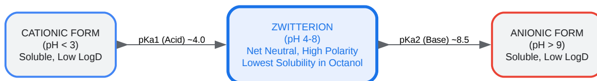
Figure 1: Ionization Equilibrium of Pyrimidinyl-Morpholine Carboxylic Acids

The following diagram illustrates the species distribution across the pH scale for a generic pyrimidinyl-morpholine carboxylic acid.