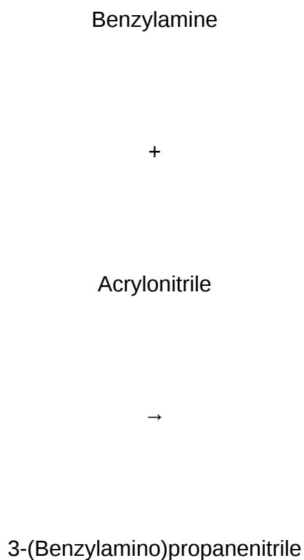
Figure 1: General reaction scheme for the synthesis of 3-(benzylamino)propanenitrile .

Click to download full resolution via product page