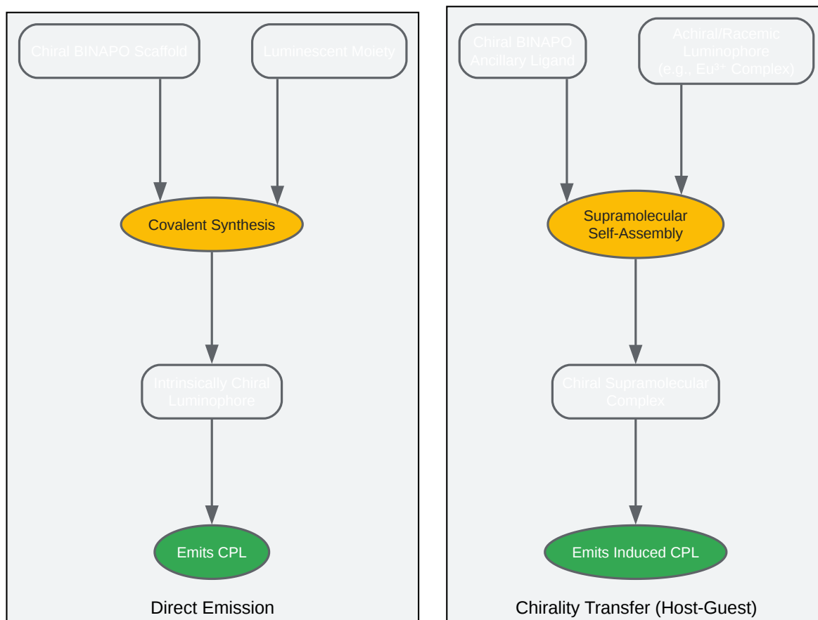
Fig 1. Mechanisms of CPL Generation with BINAPO