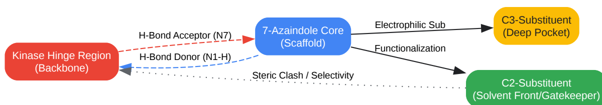
Diagram 1: Kinase Hinge Interaction & SAR Vectors

Click to download full resolution via product page