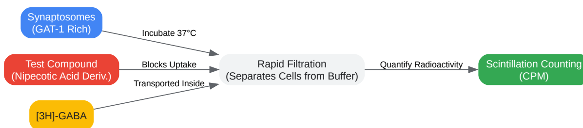
Diagram 3: Assay Logic Flow

Click to download full resolution via product page