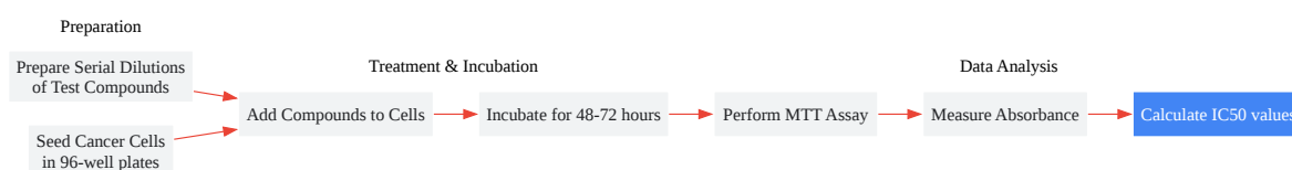
Diagram 2: Workflow for In Vitro Cytotoxicity Assay

Click to download full resolution via product page