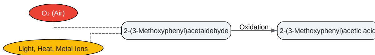
Diagram 1: Oxidation Pathway of 2-(3-Methoxyphenyl)acetaldehyde

Click to download full resolution via product page