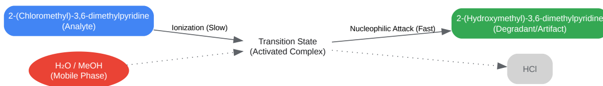
Figure 1: Degradation Pathway of CMDP

Click to download full resolution via product page