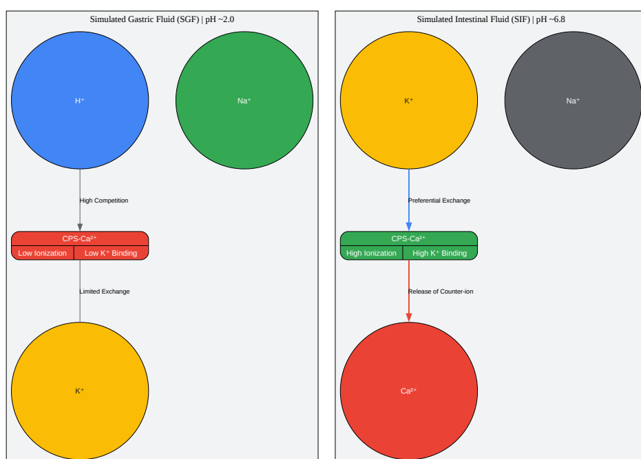
Figure 1: Principle of CPS Ion Exchange

Click to download full resolution via product page