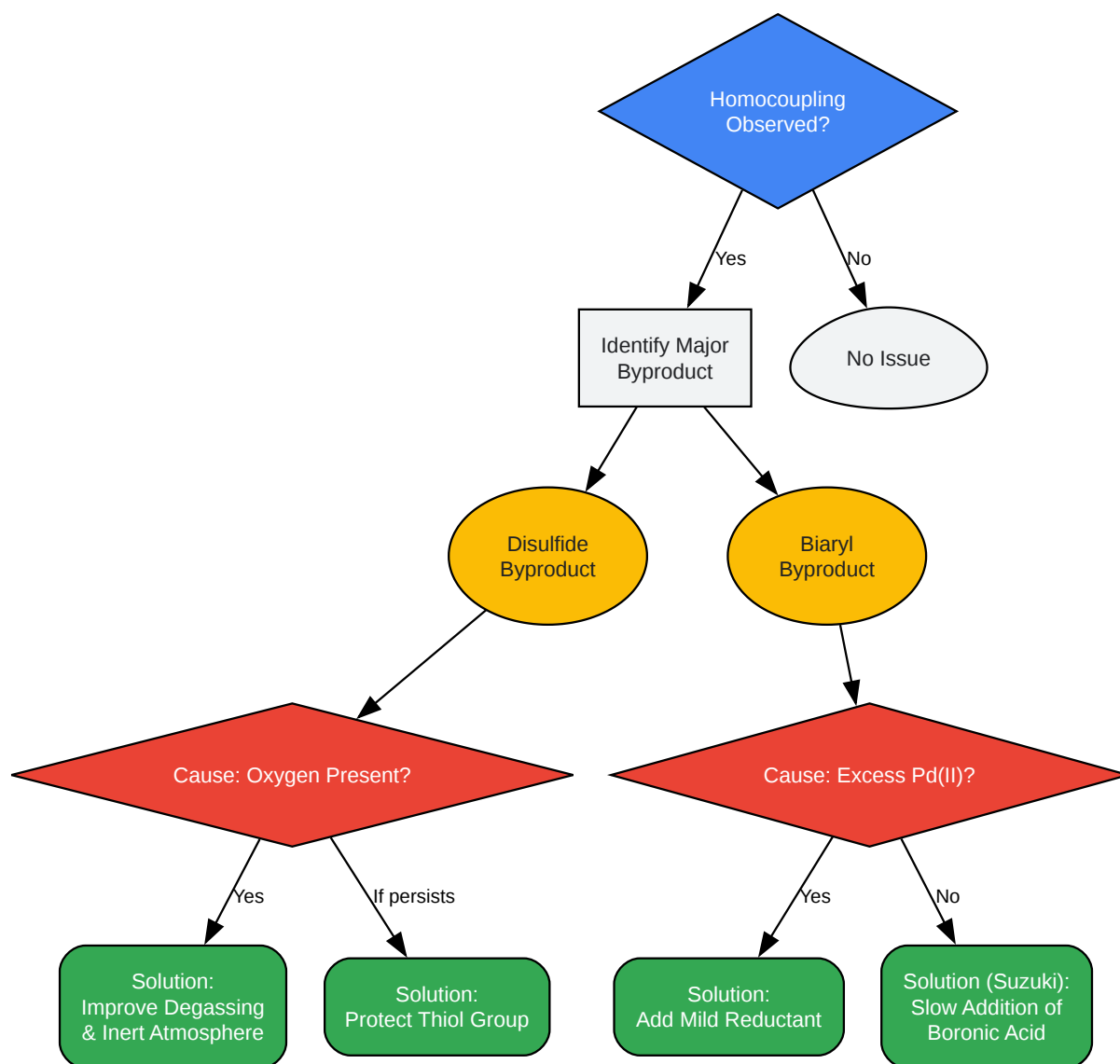
Diagram 2: Troubleshooting Workflow for Homocoupling

Click to download full resolution via product page