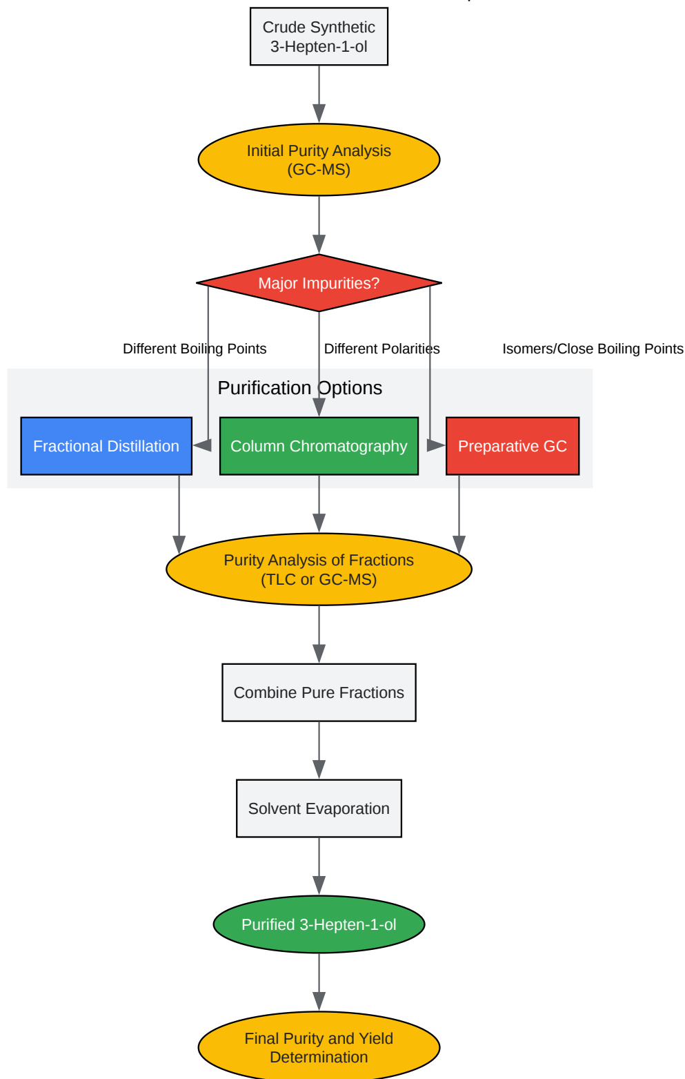
General Purification Workflow for 3-Hepten-1-ol

Click to download full resolution via product page