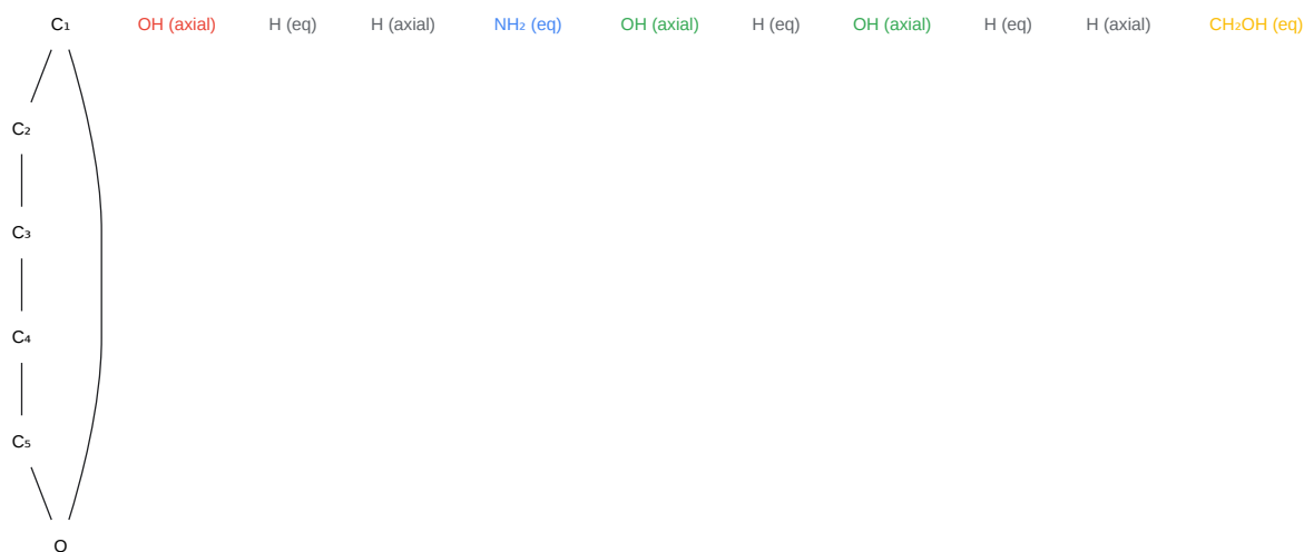
Chair Conformation of \alpha -D-Galactosamine