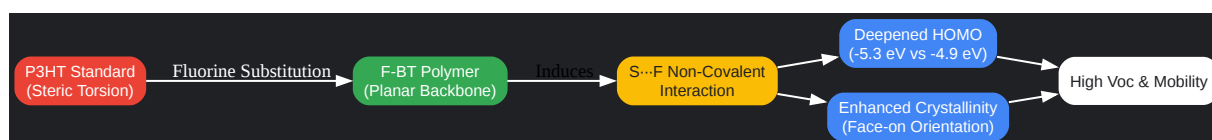
Diagram 1: The Fluorine "Locking" Mechanism & Energy Shift

Click to download full resolution via product page