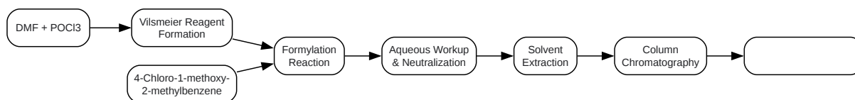
Diagram 1: Vilsmeier-Haack Reaction Workflow

Click to download full resolution via product page