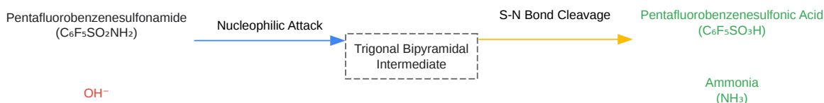
Figure 1: Base-Catalyzed Hydrolysis of PFBSA

The highly electron-withdrawing pentafluorophenyl group exacerbates this process by further increasing the partial positive charge on the sulfur atom, making it a more attractive target for nucleophiles.