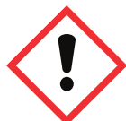
Table 2: GHS Hazard Classification | Hazard Class | Category | Hazard Statement | Pictogram | Signal Word | | :--- | :--- | :--- | :--- | :--- | | Acute Toxicity, Oral | Category 4 | H302: Harmful if swallowed |

| Warning | | Skin Sensitization | Category 1 | H317: May cause an allergic skin reaction |