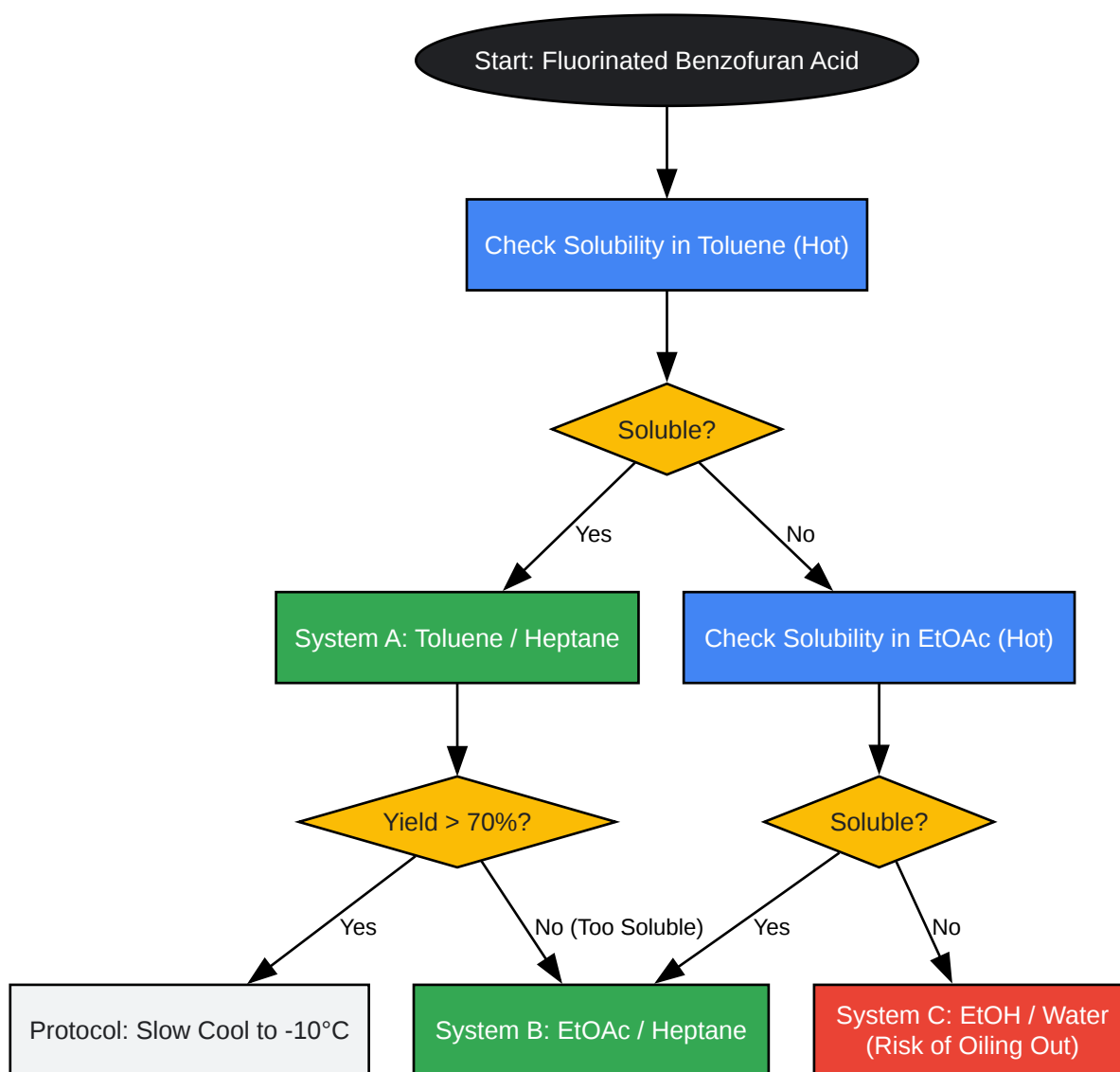
Figure 1: Solvent Selection Decision Tree