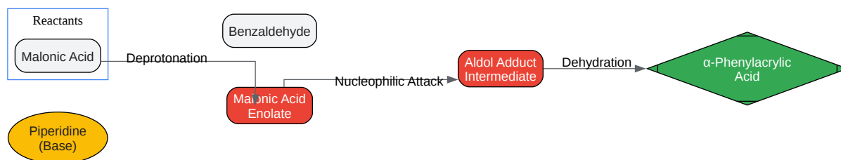
Diagram 1: Knoevenagel Condensation Pathway

Click to download full resolution via product page