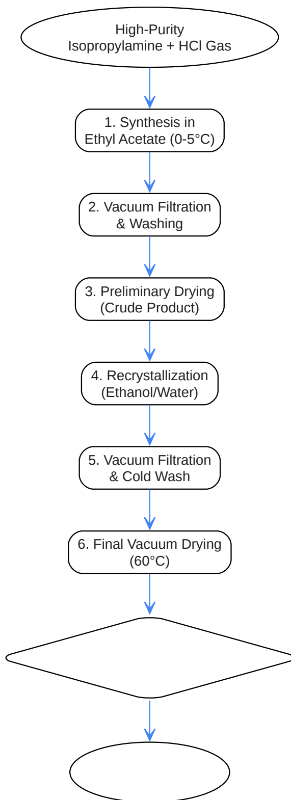
Figure 2: High-Purity Synthesis Workflow

Click to download full resolution via product page