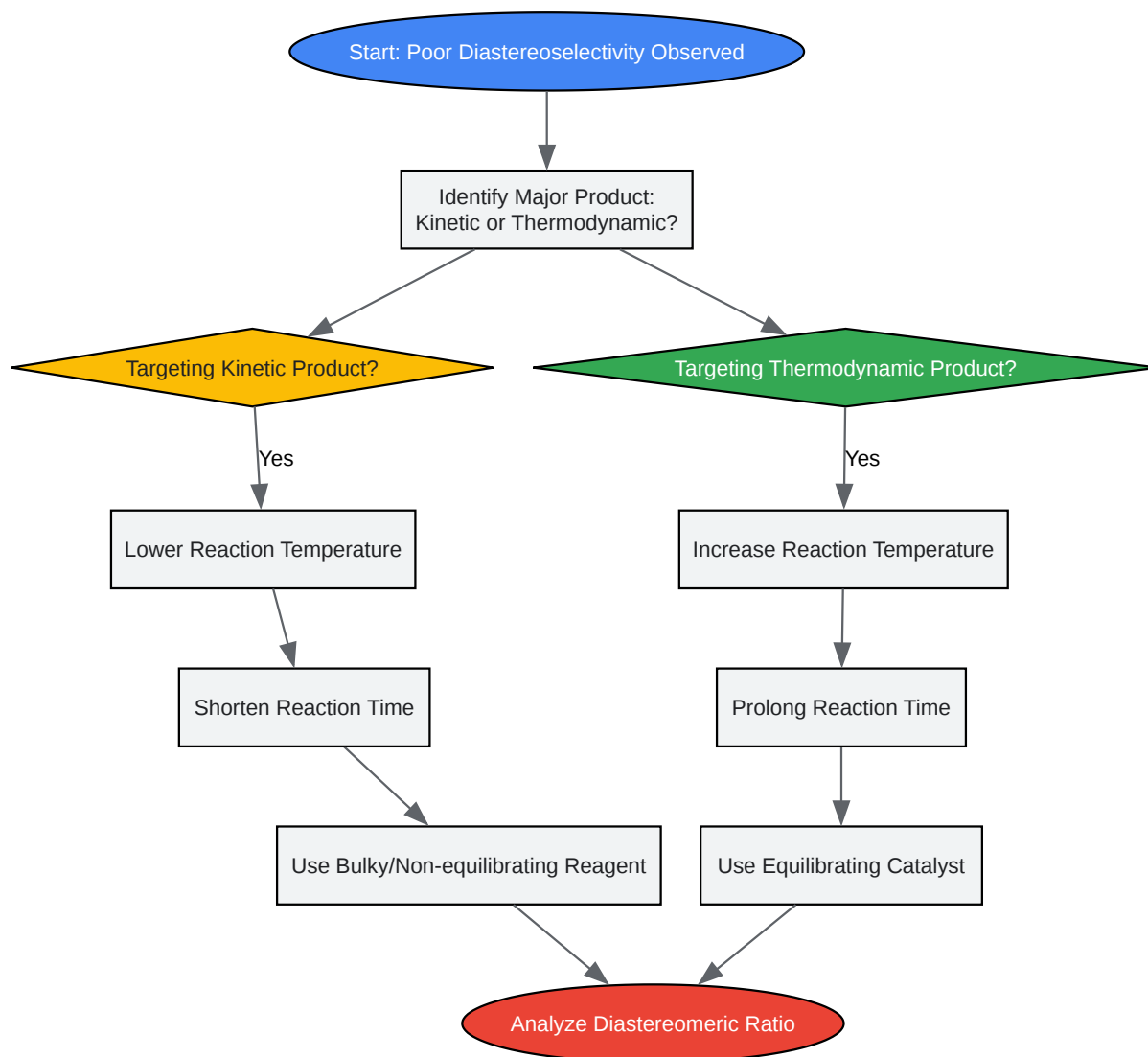
Figure 2: Troubleshooting Workflow for Poor Diastereoselectivity

Click to download full resolution via product page