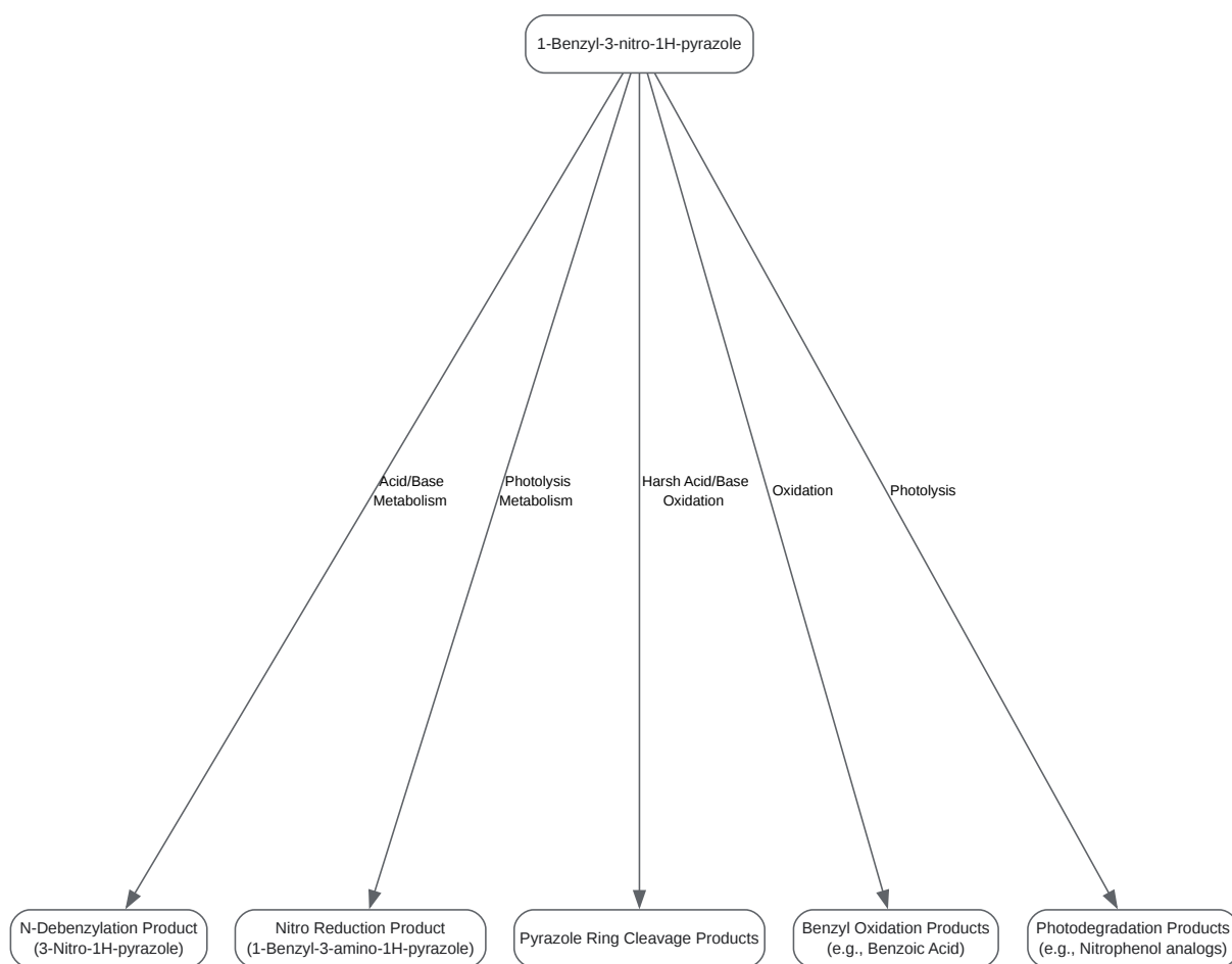
Diagram 1: Potential Degradation Pathways