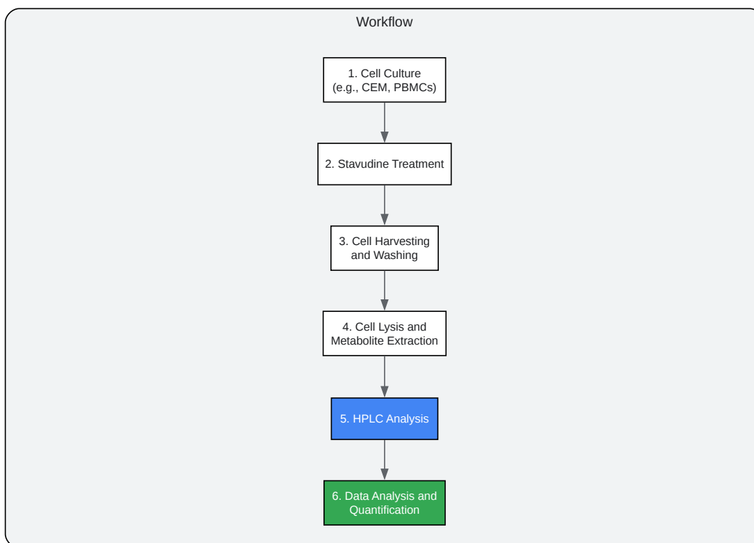
Experimental Workflow for Intracellular Stavudine Metabolism Analysis