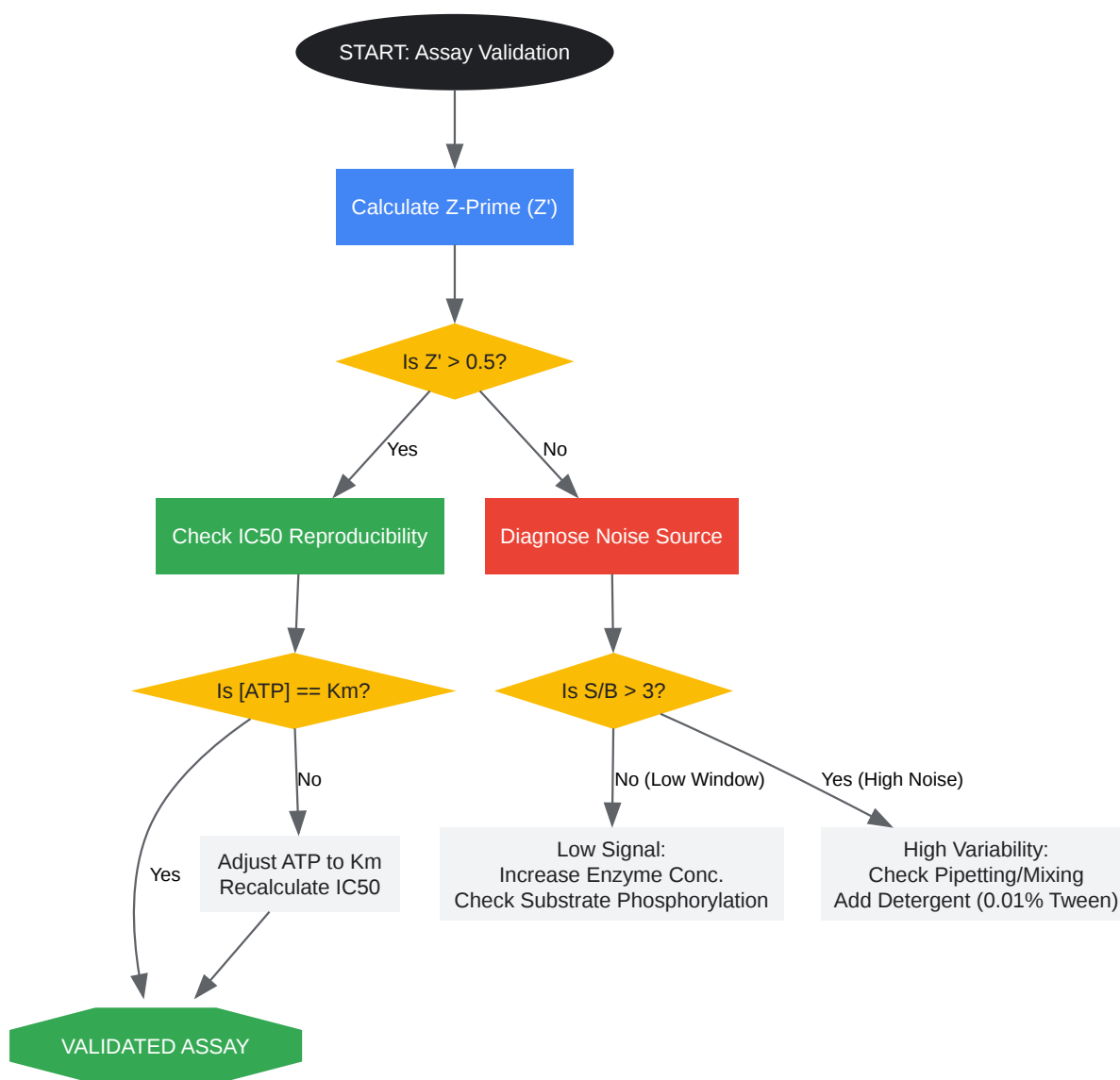
Caption: A logical workflow to isolate the source of variability based on statistical performance (Z') and kinetic parameters.

Click to download full resolution via product page