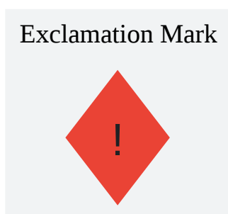
GHS Pictogram for Irritants

A corresponding GHS pictogram would be the exclamation mark. [2]