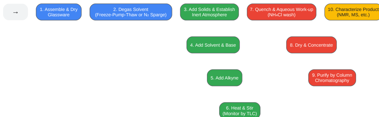
Figure 2: General Experimental Workflow

Click to download full resolution via product page