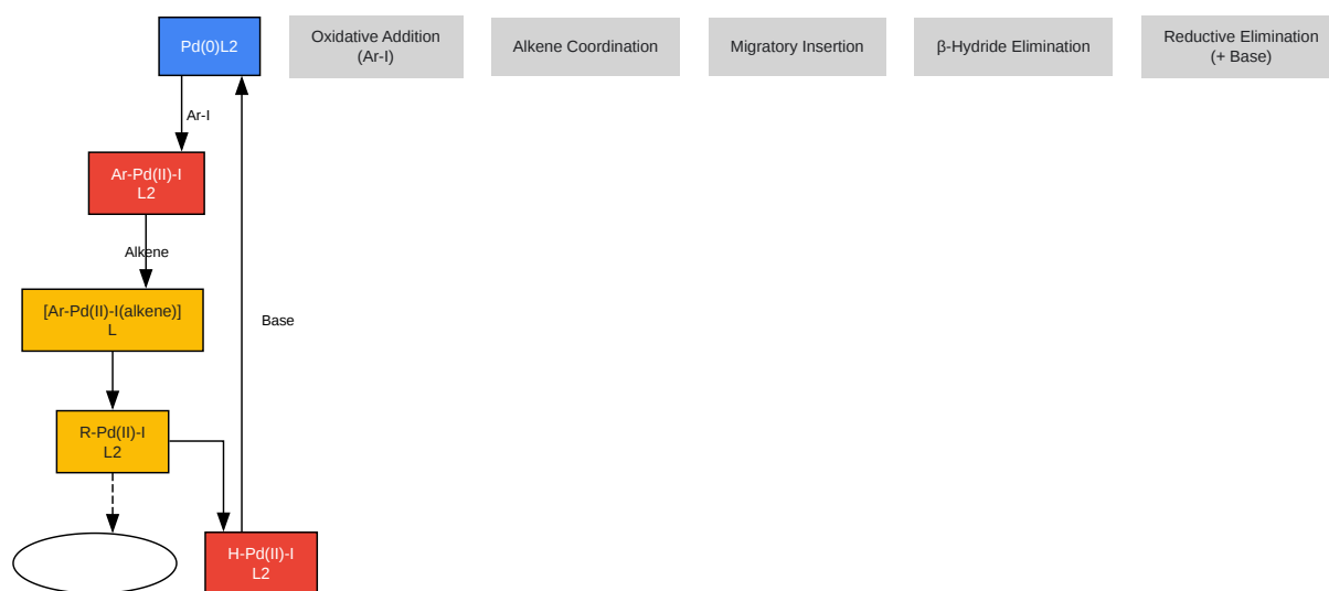
Diagram: Catalytic Cycle of the Heck Reaction

Click to download full resolution via product page