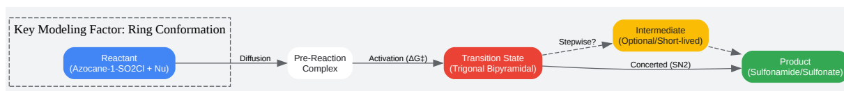
Diagram: Reaction Mechanism & Pathway

Click to download full resolution via product page