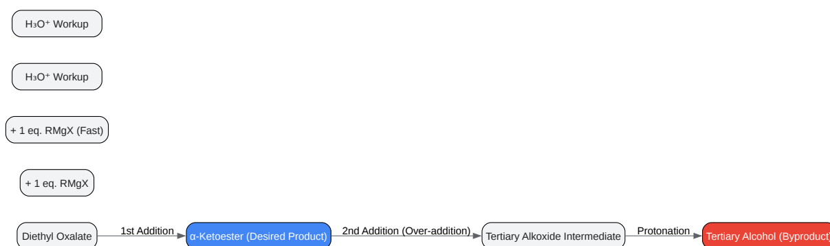
Diagram of Over-Addition Pathway:

Click to download full resolution via product page