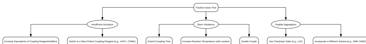
Diagram: Troubleshooting a Positive Kaiser Test

Click to download full resolution via product page