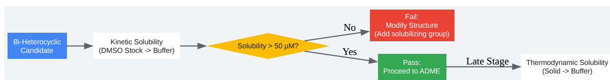
Diagram: Solubility & Permeability Logic

Click to download full resolution via product page