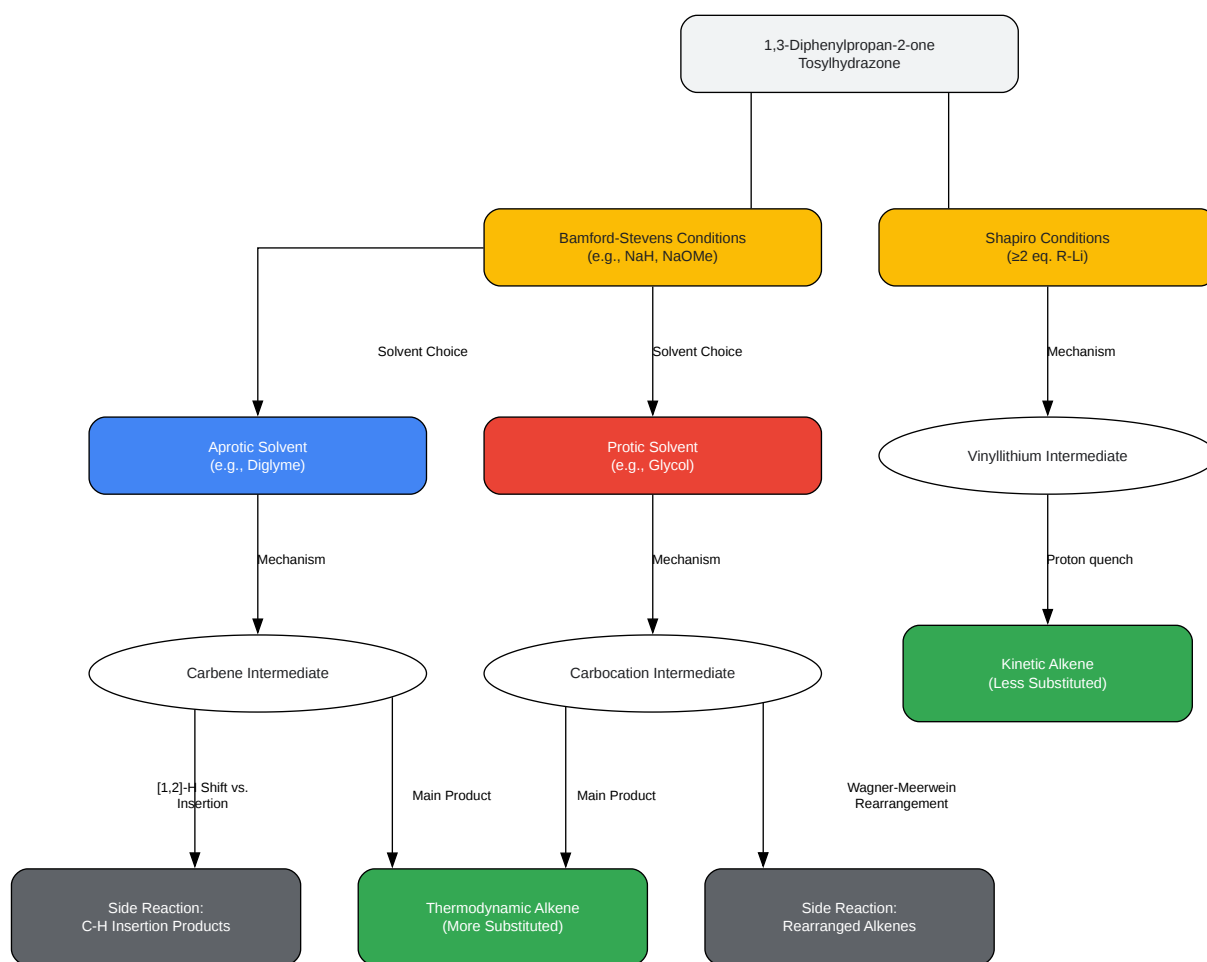
Figure 1: Main Decomposition Pathways and Side Reactions

Click to download full resolution via product page