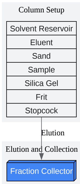
Figure 2. Diagram of a flash chromatography column.

Click to download full resolution via product page