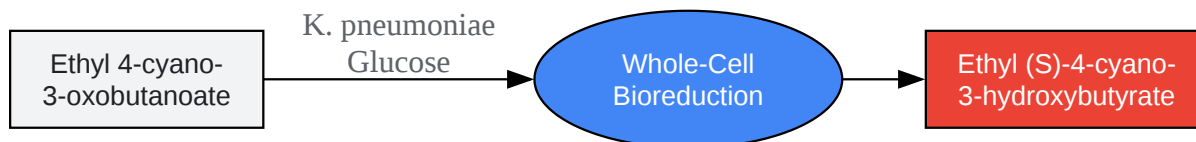
Caption: Chemoenzymatic synthesis of Ethyl (S)-4-cyano-3-hydroxybutyrate .

Click to download full resolution via product page