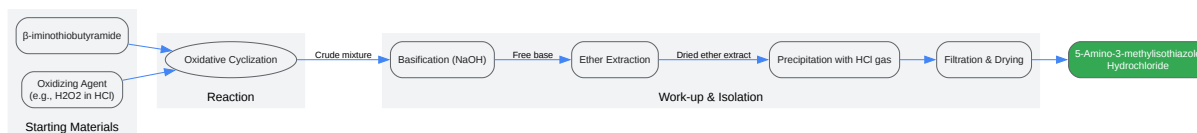
Figure 1: Synthesis Workflow for 5-Amino-3-methylisothiazole