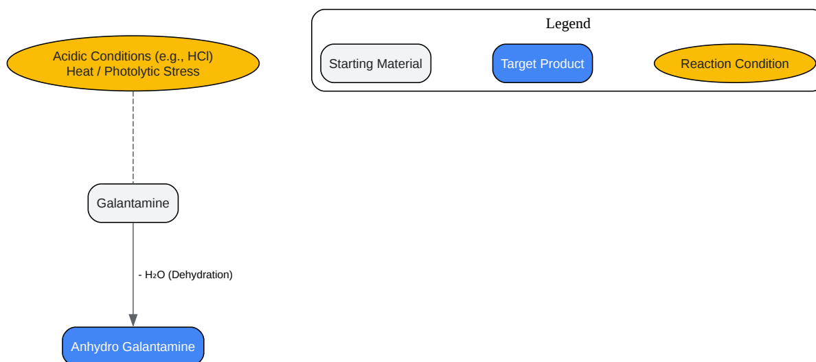
Diagram: Formation of Anhydro Galantamine

Click to download full resolution via product page