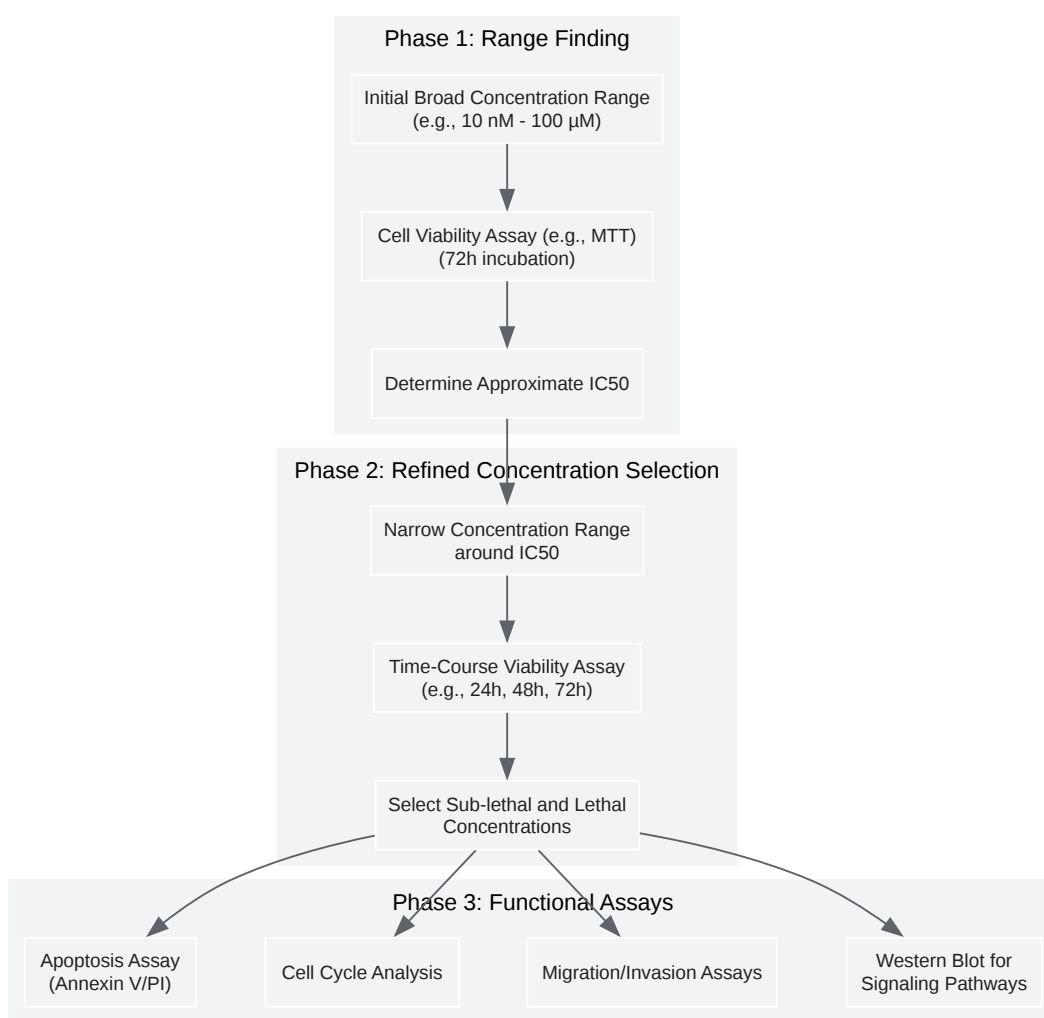
General Workflow for Determining Optimal Emetine Concentration

The following diagrams, generated using the DOT language, illustrate key signaling pathways affected by emetine and a general workflow for determining its optimal concentration.