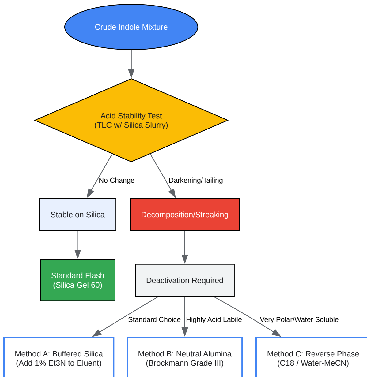
Diagram 1: The Indole Purification Decision Matrix This workflow illustrates the decision process for selecting the correct stationary phase based on compound stability.

Click to download full resolution via product page