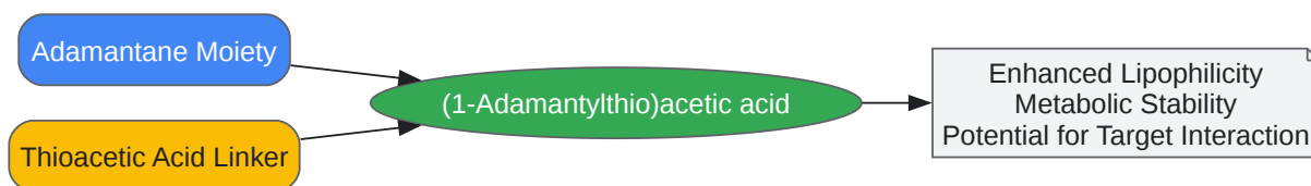
Caption: Drug discovery workflow for (1-Adamantylthio)acetic acid .

Click to download full resolution via product page