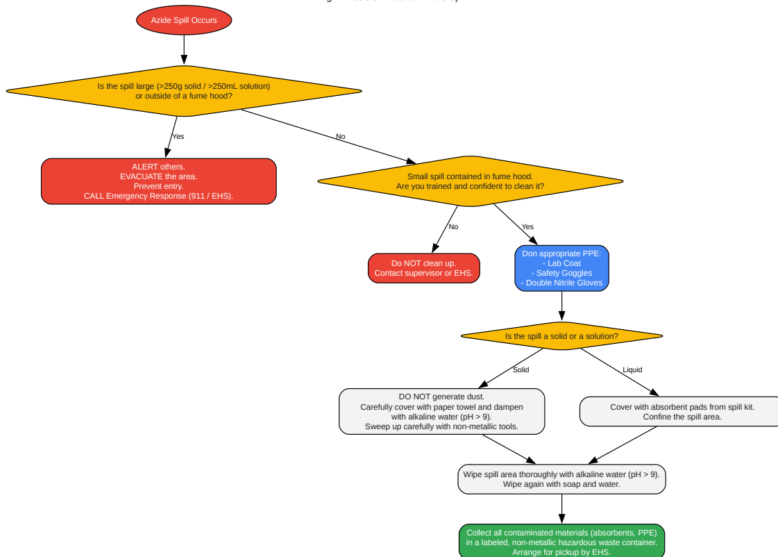
Fig 1. Decision Tree for Azide Spill

Click to download full resolution via product page