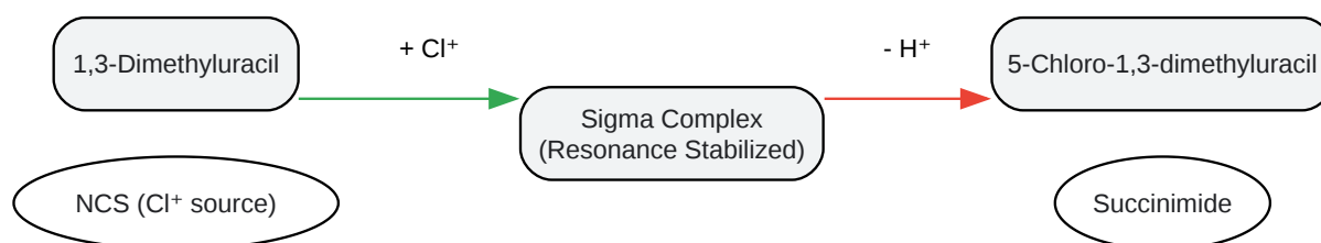
Figure 1: Mechanism of C5 Chlorination

Causality of Regioselectivity: The C5 position is the most nucleophilic site on the ring. This is due to the resonance contribution from both the adjacent nitrogen atoms and the enamine-like character of the C5-C6 double bond. The electrophilic chlorine species ( \text{Cl}^+ ), generated from the chlorinating agent, is attacked by the \pi -electrons of this double bond. This attack preferentially occurs at C5, leading to a resonance-stabilized carbocation intermediate known as a sigma complex or arenium ion. Subsequent deprotonation at C5 by a weak base (like the succinimide anion byproduct) restores the aromaticity of the ring, yielding the final 5-chloro product.[3][4]