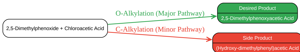
Figure 2: Desired O-Alkylation vs. Competing C-Alkylation

Click to download full resolution via product page